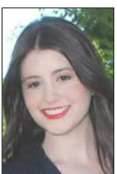
THE CURIOUS COLUMNIST

Armed with a binder of documents, a Ziploc bag of goldfish crackers, my favorite fuchsia pen and a crossword omnibus, I was equipped for any surprises that Social Security had in store. Although the binder's contents and pen did come in handy, the additional weapons in my arsenal were relegated to my tote for the duration. Alas,